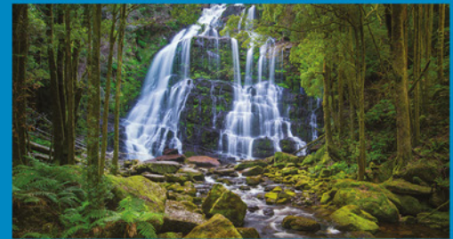
Tasmania's Cradle Mountain and Wild West Coast, 6 nights