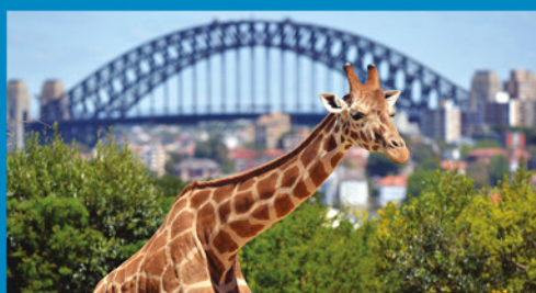
Taronga Zoo Wildlife Retreat Experience, 2 nights