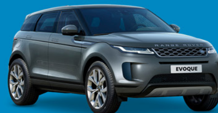
2020 Range Rover Evoque Supplied by Melbourne City Land Rover