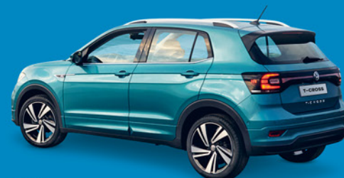
2020 Volkswagen T-Cross