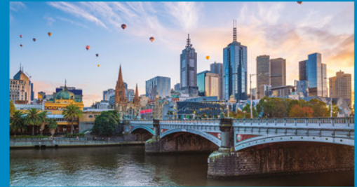
Melbourne Weekend Getaway, 1 night

All supplied by Helloworld Travel Niddrie