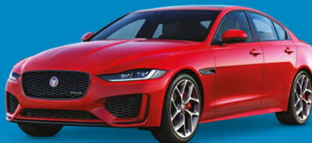
2020 Jaguar XE