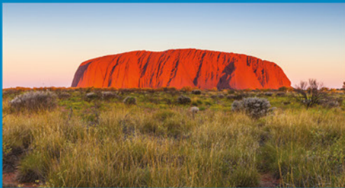
Ultimate Uluru, 7 nights

Tropical North Queensland for Families, 10 nights