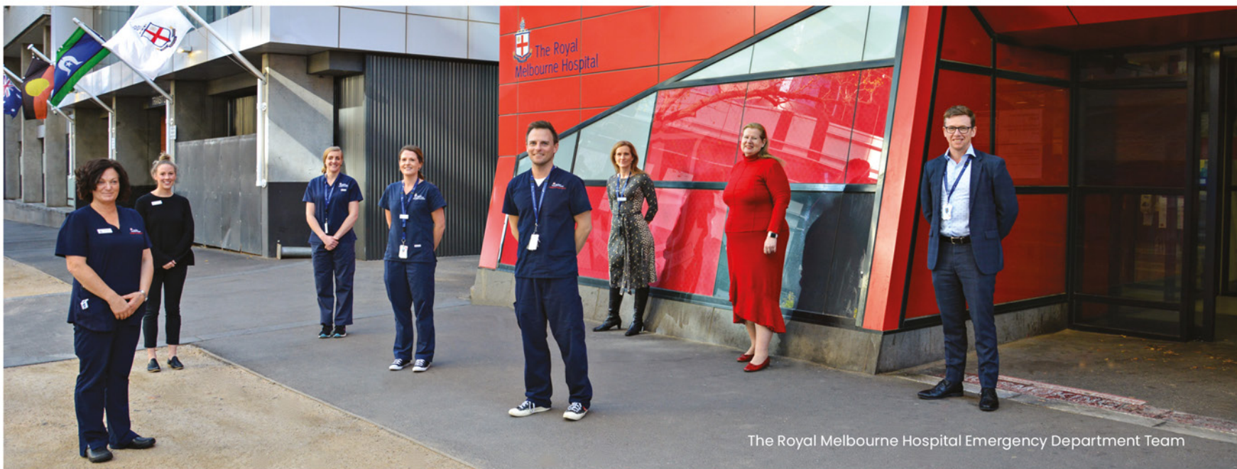
The Royal Melbourne Hospital Emergency Department Team