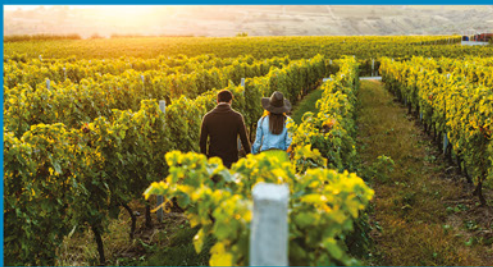
Barossa Valley, 2 nights