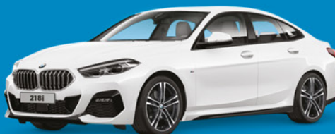
2020 BMW 218i Gran Coupé Supplied by Doncaster BMW