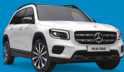
2020 Mercedes-Benz GLB 200