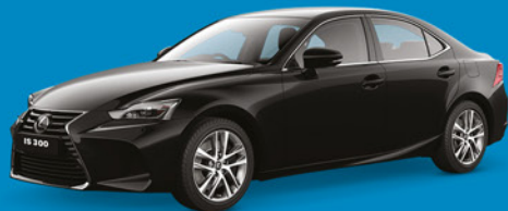
2020 Lexus IS 300 Luxury Supplied by Melbourne City Lexus