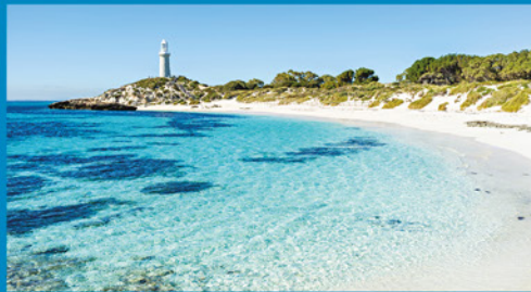
Rottneest Island for Families, 5 nights